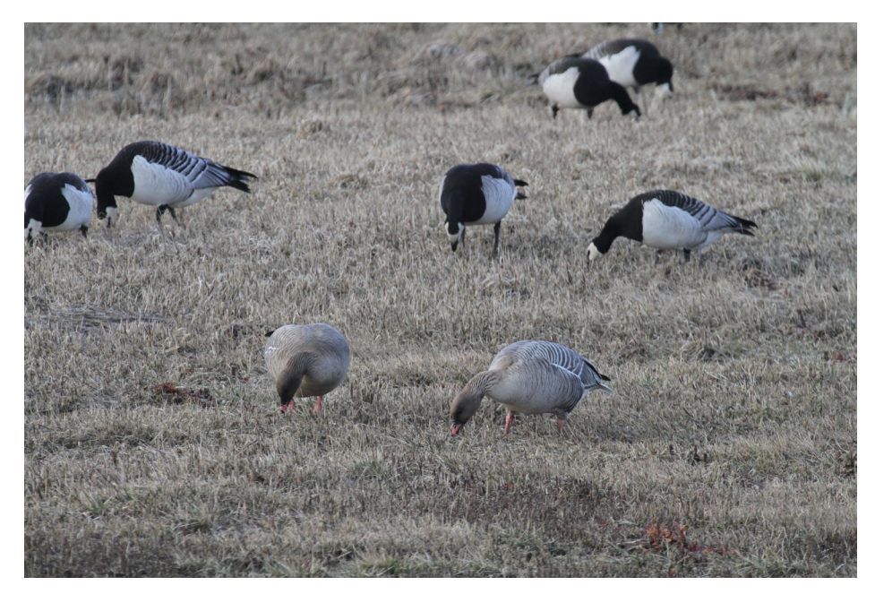
Figure 2. Pink-footed Geese (foreground) and Barnacle Geese spring-staging in North Norway (Photo: Ingunn M. Tombre).

by the project team and co-workers for more than two decades (see Tombre et al. 2008, 2010; Madsen & Williams 2012 for an overview of relevant references). In-depth interviews of several stakeholders have been conducted in both regions in 2004, 2007 and 2011/2012 (Vesterålen; Eythórsson 2005; unpublished data, Nord-Trøndelag; Søreng 2008; unpublished data). The geese feed primarily on cultivated private land, a situation that makes communication with farmers and