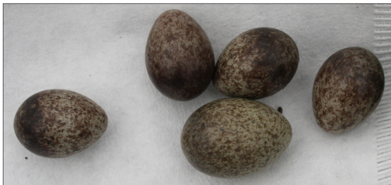
Figure 3. A clutch of Meadow Pipit Anthus pratensis eggs and a Common Cuckoo Cuculus canorus egg. The cuckoo egg shows quite good mimicry with the Meadow Pipit eggs.

The average dates for Meadow Pipits to initiate egg-laying in the period 2004–2014 are provided in Table 2. In the present material, cuckoos laid eggs from 6 to 24 June. In Area I, and for the whole data set, the average egg-laying date of the cuckoo was 14 June ( n = 11 ). In Area II, the cuckoo laid her egg on 10 and 11