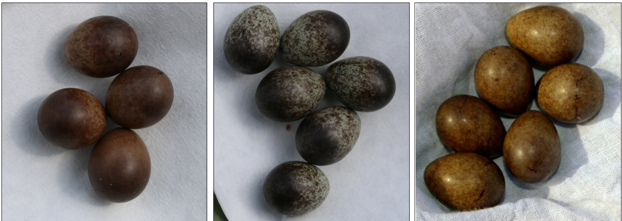
Figure 1. Examples of Meadow Pipit Anthus pratensis egg clutches showing considerable differences between but minor differences within clutches.

Figure 1 shows examples of Meadow Pipit egg clutches. The colour and markings of Meadow Pipit