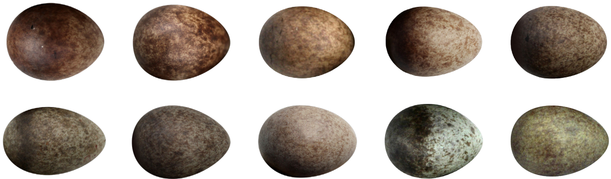
Figure 2. Eggs of Common Cuckoo Cuculus canorus (a) and Meadow Pipit Anthus pratensis (b).

eggs vary between the clutches, whereas the differences between the eggs in the same clutch regularly showed only minor differences. Photos of all the cuckoo eggs recorded and a sample of Meadow Pipit eggs are presented in Figure 2a and Figure 2b, respectively. The overall impression is that the eggs show quite good accordance between cuckoo and Meadow Pipit eggs (see Figure 3 for an example). To the human eye, the