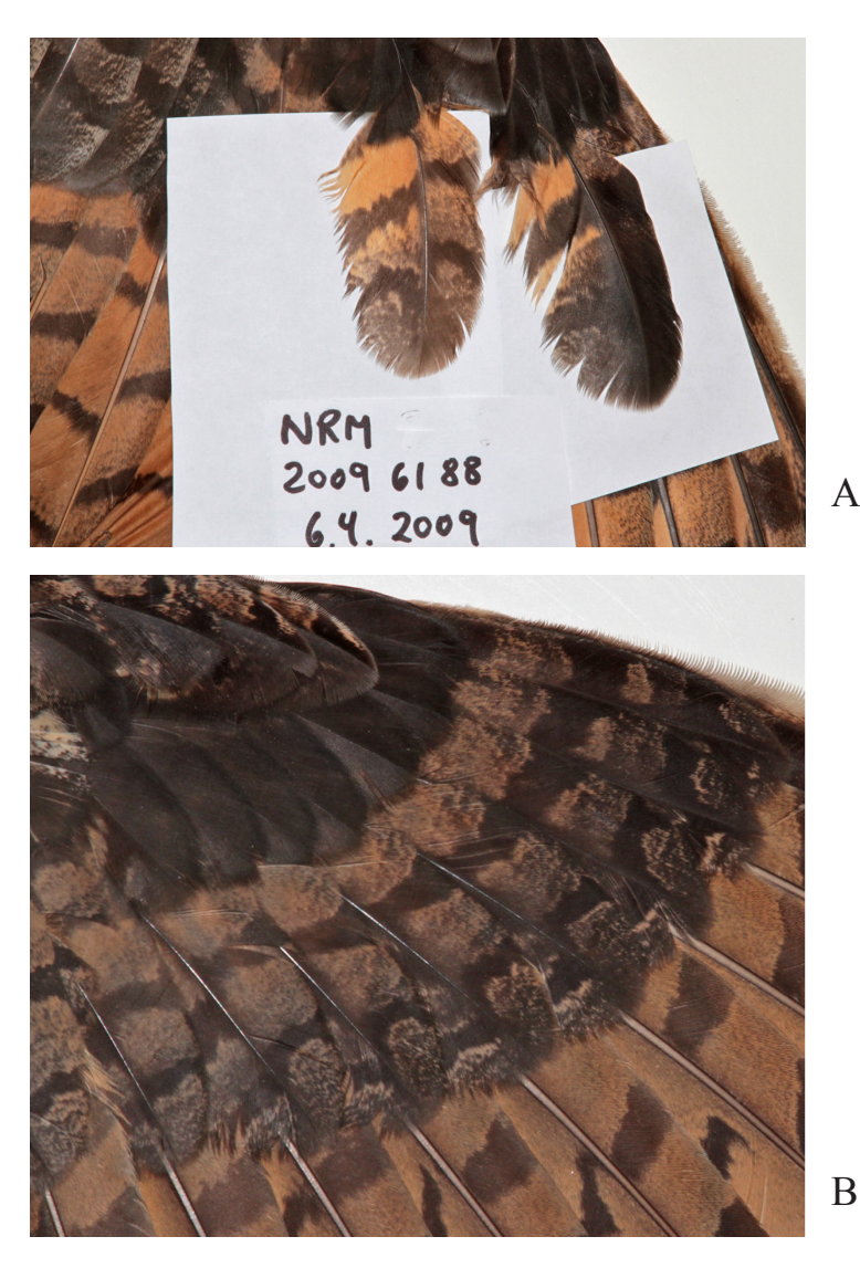
Figure 1. A. Juvenile (left) and adult (right) greater coverts of Eagle Owl after second flight feather moult M2 (Catalogue no. 20096188). Dark bands are thinner and more irregular in the juvenile covert. In the adult covert the outer vane is darker and bands are obscured. B. Uniformly juvenile greater coverts of Eagle Owl.

Primary coverts and greater coverts are usually moulted the same summer as the corresponding flight feather is lost. Sometimes contrasts between juvenile and adult feathers are easier to see among coverts than among flight feathers (Figure 1A, B). It is thus of great importance to check the main coverts when inspecting an Eagle Owl wing for moult patterns.