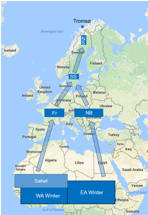
Figure 1. Approximate positions of areas for which climate data were downloaded along the migration route of Pied Flycatchers, Willow Warblers and Chiffchaffs between the wintering area and breeding area in North Norway (WA = West Africa, EA = East Africa, Fr = France, NB = Northern Balkans, SS = South Sweden and NS = North Sweden – see Appendix 1 for geographical coordinates of the areas). The western (Pied Flycatchers, Chiffchaffs) and eastern (Willow Warblers) return routes are indicated by arrows.

delay refuelling (Ahola et al. 2004, Gordo et al. 2005). Here, I relate arrival times of the three spring migrants to climatic conditions at the start of their northward migration and en route to North Norway to see where the responses are strongest.