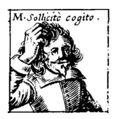
Figure 6 Detail from diagram from John Bulwer, Chirologia .

We have used the example of human hand, and in part its two familiar functions of pointing and touching, in order to explore, but by no means fully exhaust, early modern epistemological questions related to "Matter, mind and spirit". The intention has been to follow the hand as a thread through multiple and interwoven discourses in early modern England, creating a dialogue between the different, but also overlapping disciplines as a useful co-illuminating factor. Bulwer, Harvey and Shakespeare are all handling similar questions of how to understand relations between mind and body, but in significantly different ways that prove the non-linearity in the development of these paradigms. All three writers are pre-Cartesian, but that does not mean that they simply represent a