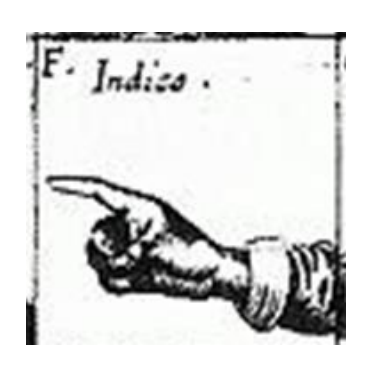
Figure 3 Detail from diagram from John Bulwer, Chirologia .

The illustration "F" with the title "Indico" (Figure 3) provides the viewer with the sense of active command and direction described by Bulwer. The hand depicted here may be interpreted as containing a sense of determination, due to the way in which it implies a strong and direct line through the arm to the point of the index finger. Being, as Bulwer says, used to demonstrate (and of course figuratively to point something out), the gesture of pointing is perhaps the most familiar of all manual signs and also appears in the form of the manicule in various early modern disciplines. It is closely aligned with sight in directing another person's eye towards the object pointed at, but there is also frequently a claim to superior knowledge or status