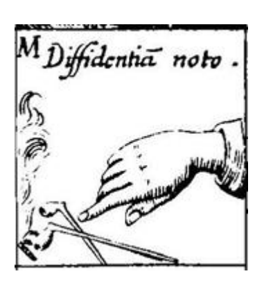
Figure 4 Detail from diagram from John Bulwer, Chirologia .

The conceptual understanding of touch offers in itself a somewhat contradictory perspective on the early modern period, as Elizabeth Harvey and others have shown in a recent anthology on touch in early modern culture. In her introduction, Harvey describes touch as a sense at once elevated and debased compared with the other senses and explains how, mainly through the legacy of Aristotle, sight continued to occupy a primary position among the senses, whereas touch was more commonly connected to the bestial and/or erotic elements of human perception. However, as Harvey writes, and as we shall see in William Harvey's medical illustrations further on, "tactility is associated with authoritative scientific, also