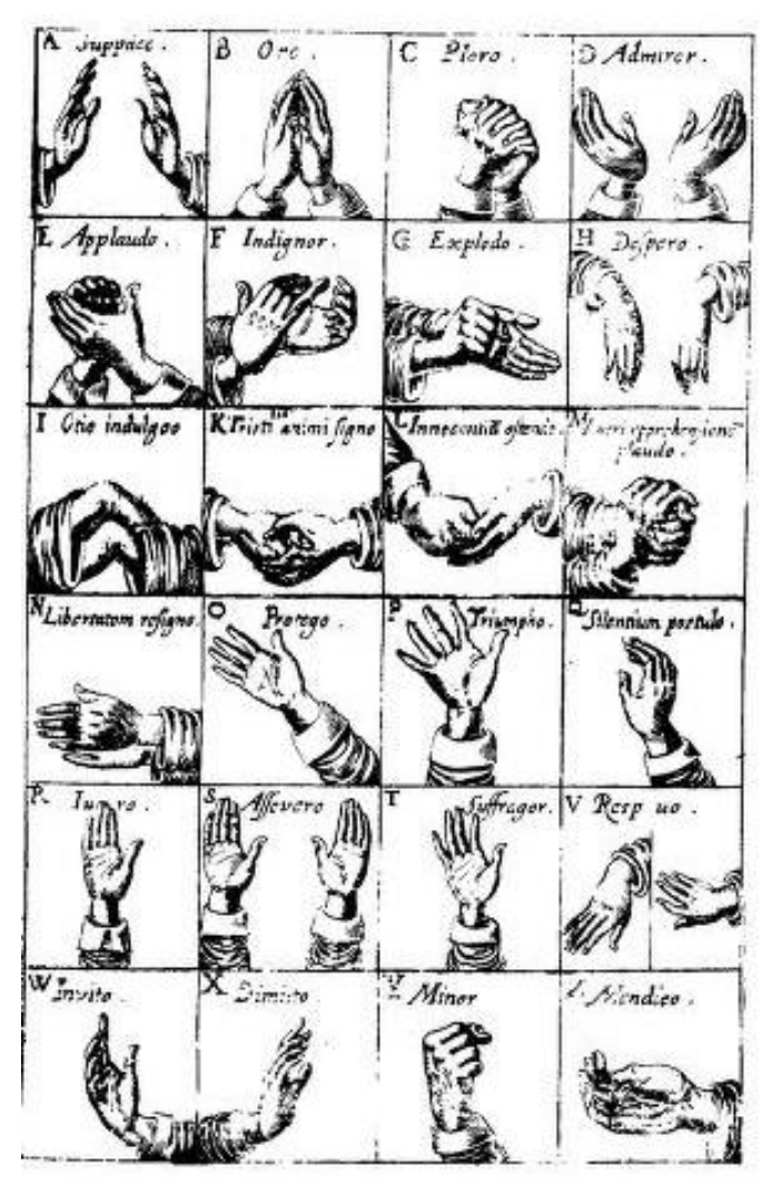
Figure 1 Diagram from John Bulwer, Chirologia . All images in this article can be found at archive.org

something unto to what it touches, it takes in what it perceives; a touching hand receives information and sends it inwards. The perceptive act of touching implies a certain permeable quality to the hand (certainly to the skin covering it). Thus touching, as we shall explore further on, is significantly passive as well as active; it is a movement of the hand that potentially blurs distinctions between perceiving subject and perceived object.<sup>11</sup>