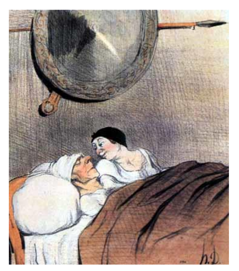
Figure 3 Honore Daumier Odysseus and Penelope 1842

Sheridan's The Critic, or, A Tragedy Rehears'd: a Farce (1779) is a wonderfully funny play, but it has a serious point: how do you get out from under Shakespeare's shadow, and escape from what were once useful conventions for him, but which are now empty clichés? The play's intimate relation to Hamlet which preceded it in the first performance is used to explore what the relation might be between drama and what for want of a better word I shall call the consenting audience. How is that audience manipulated into consent by the art of Puffing?