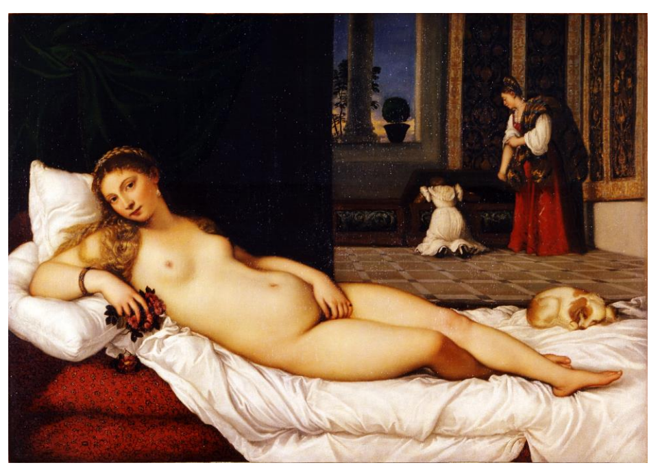
Figure 2 Titian Venus of Urbino 1538

inheritance (Figures 1 and 2). Think of the huge amount of classicising architecture and art in the decades around and after the French revolution: the Empire style, the vocabulary of the Directoire, the paintings of Jacques Louis David, and so on. But this is the very time when radical differences between the inherited and the actual, the present day, are beginning to be obvious, with industrialisation and all its consequences. So a painting likes Manet's Olympias (1863), a painting of a whore, asks a serious question about that painting on which it puns, Titian's Venus of Urbino (1538): what relevance does that style, that inheritance, that fiction – and the